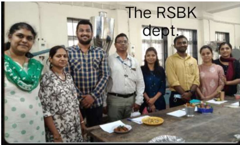
The RSBK dept.