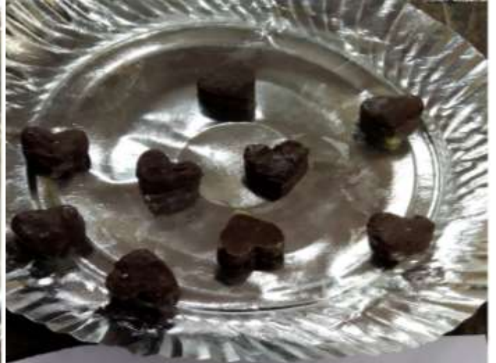
आमलकी रसायन chocolate 21/3/20