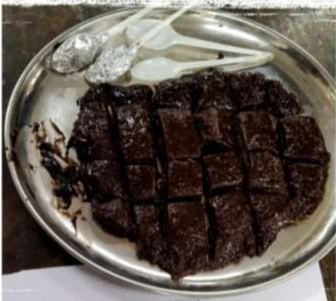
आमलकी रसायन चिककी