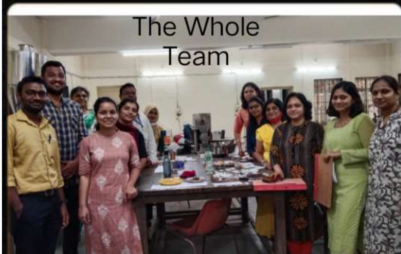
The Whole Team